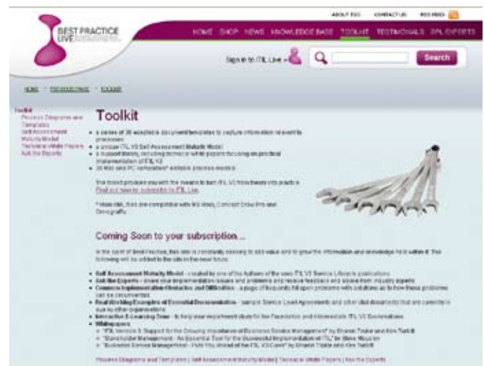
Example shows Toolkit

The ITIL Live Toolkit features instructions, materials, know-how and experience. Like all aspects of ITIL Live, the contents of the Toolkit are in a constant state of review and development so you are kept up-to-date with the latest thinking and practical guidance. Using it will not only allow you to implement elements of the framework as and when you need to, but you can be confident that you are basing your decisions and practices on the most up-to-date guidance, direct from the ITIL team.