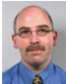
Jeroen Bronkhorst www.hp.com/blogs/itil

The Content Review Group is growing, please see below for a sample of the experts, the full listing of the review group is available at www.BestPracticeLive.com .