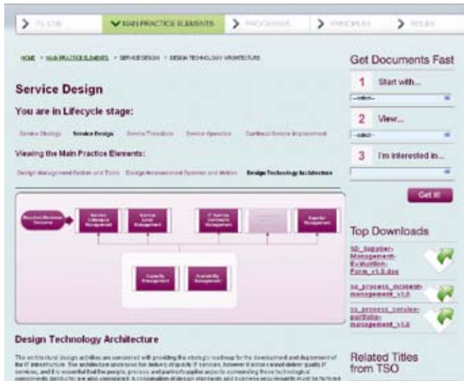
Example of MPE