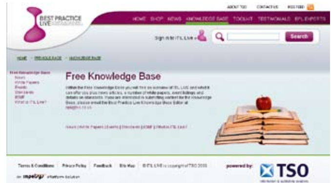
Example shows Knowledge Base

Keep an eye out for other content coming soon!